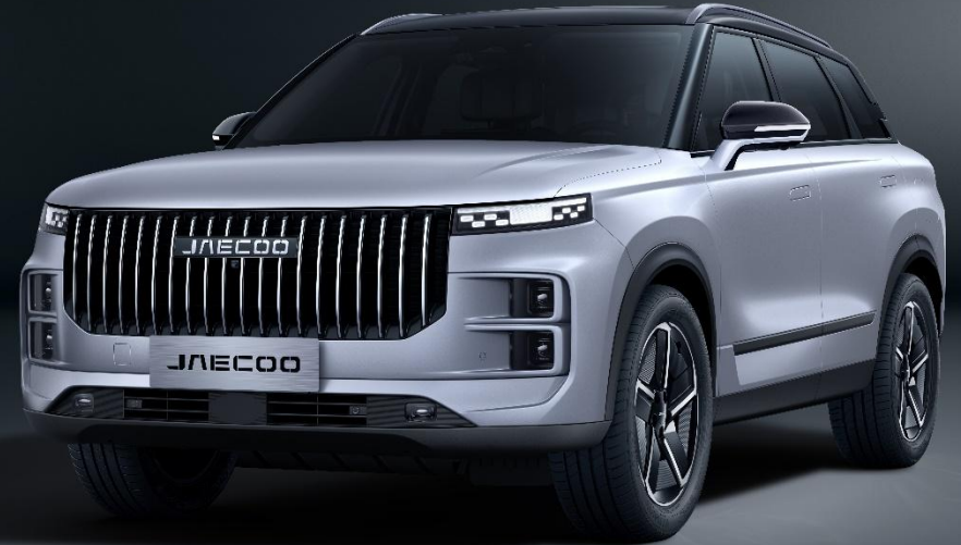
Moonlight silver-black roof