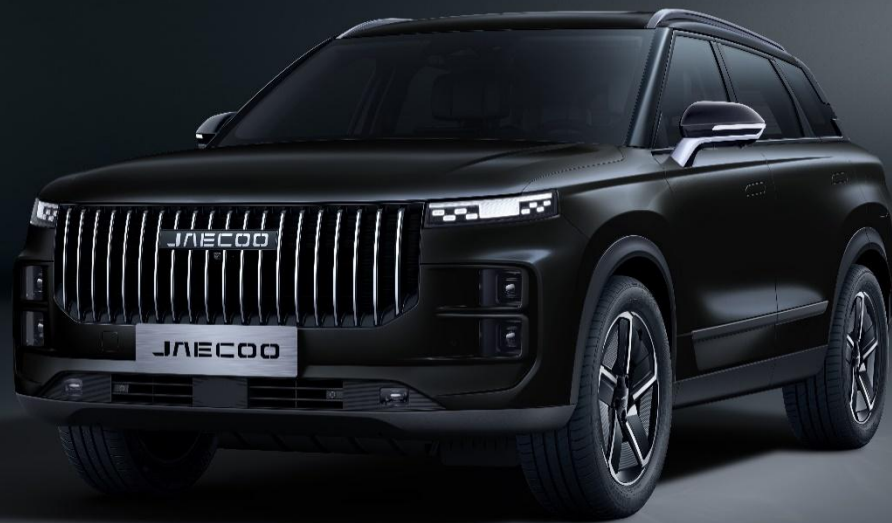
Carbon crystal black